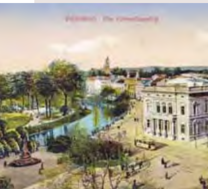
Colored postcard around 1900

Düsseldorf has been continually growing for years. The city now has over 630,000 inhabitants – not far from its historical high (1962: 705,000). On many wastelands and estates from Düsseldorf’s industrial past, new districts, quarters and spacious residential complexes are emerging around the town centre.