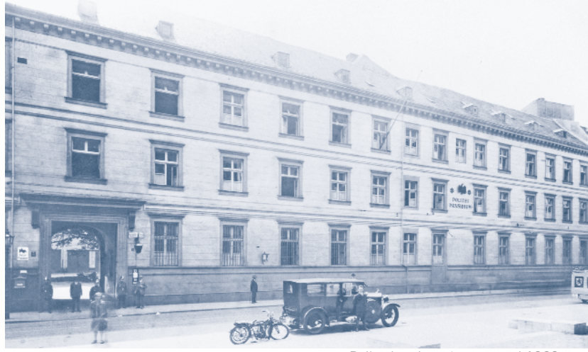
Police headquarters around 1920