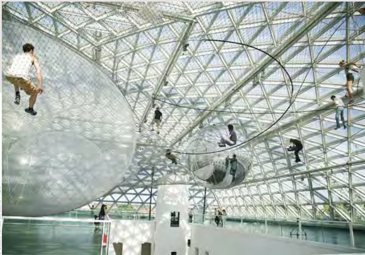
© Studio Tomás Saraceno / K21