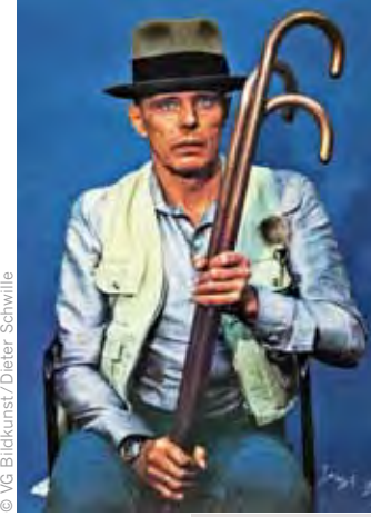
© VG Bildkunst / Dieter Schwille