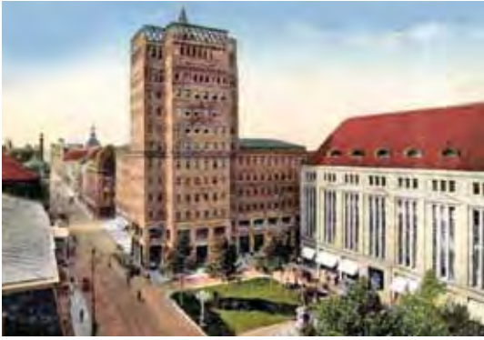
Colored postcard around 1900

Prominent buildings: the Wilhelm-Marx building and the Mannesmann building on the bank of the Rhine.