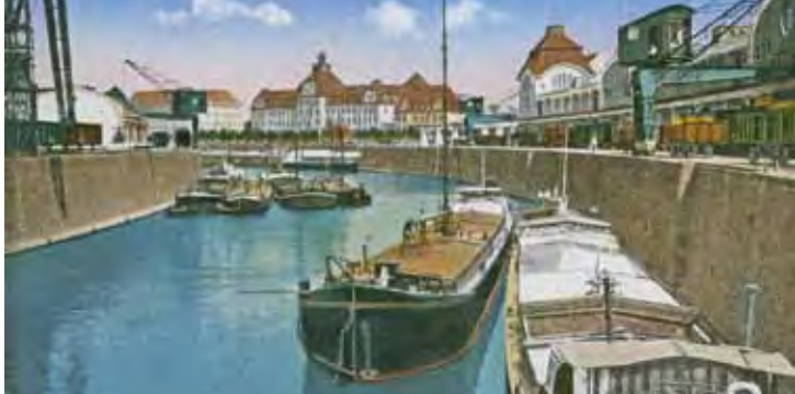
Colored postcard around 1900