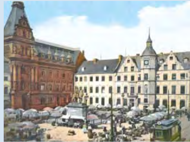
Colored postcard around 1890

with western expansion in Wilhelminian style.